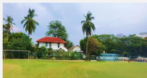
Senior hostel from the playground side

With the purpose of introducing fast growing IT careers to hostel students, seven students staying at home during the pandemic has been connected with the Silicon Valley, USA. The program was facilitated by One Billion Tech (Pvt.) Ltd.