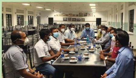
A ROCOHA Committee meeting in progress at the renovated dining hall.